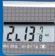
lb : oz