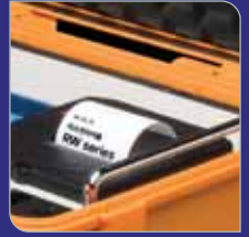
Built in printer